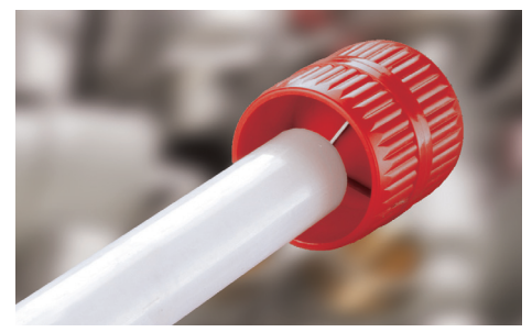
Set contains: Handle NB10006 Light weight handle for comfort and ease of use. Blades are stored inside the handle